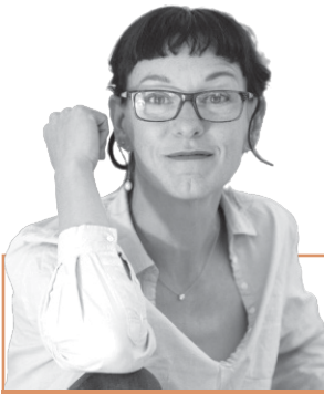
Corinne Morel-Darleux Writer